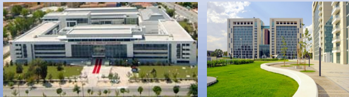
TOBB Economy & Technology University Campus, Ankara

The Workshop is funded through the EU Enlargement & Integration Action (E&IA).